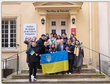
A first Ukrainian teenagers visit to ILCF